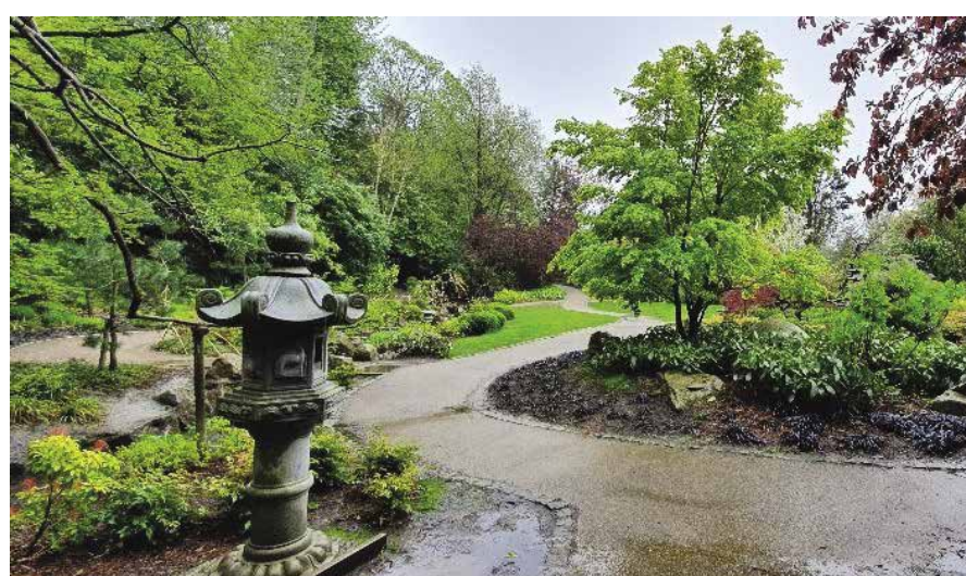
The walkers shared photos and anecdotes along the way